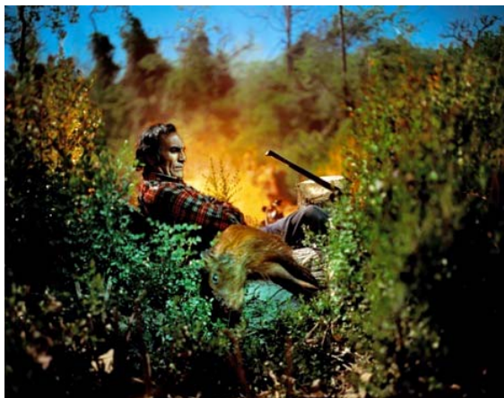
Photograph by Alejandro Chaskielberg. The Hunter.