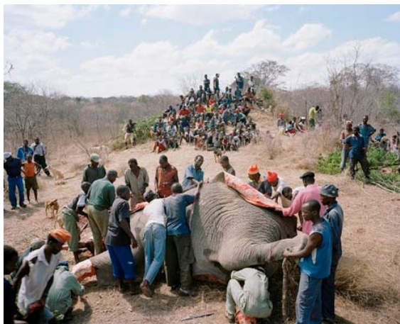
Elephant Hunter, Zimbabwe.