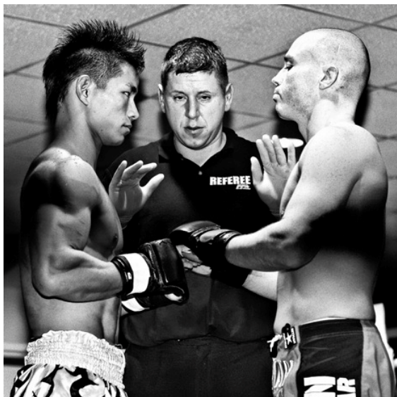
Martial Arts.