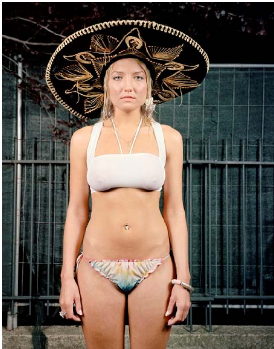
Beauty Contest, Italy.