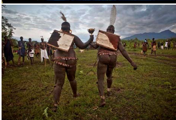
Fat Man Competition, Ethiopia.