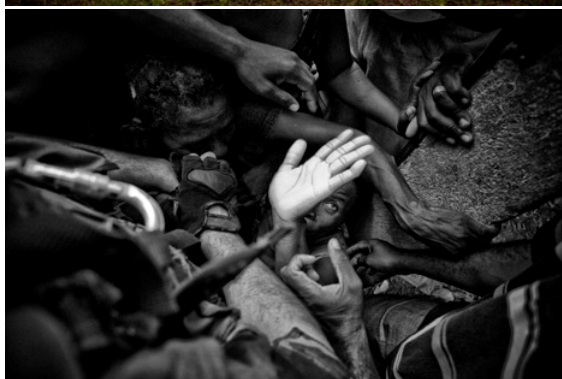
Haiti earthquake, Port au Prince, January.