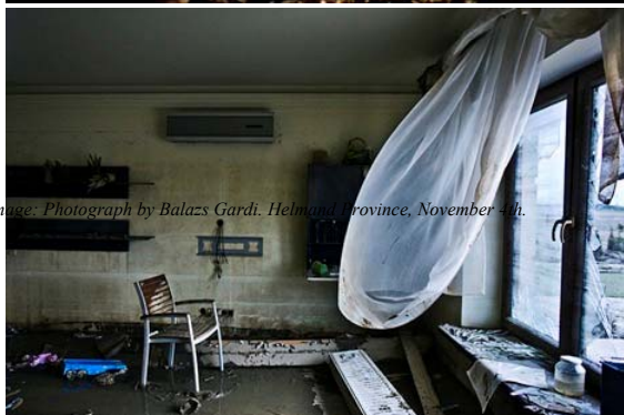
Top image: Helmand Province, November 4th.